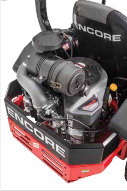
Caliber | Engine View