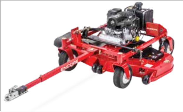
TRACER | 60"