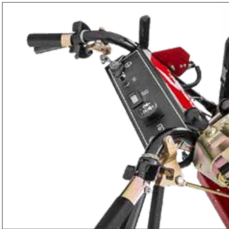
HYDRO SERIES | Easy to Use Controls