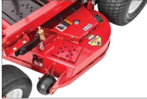
Caliber | Convenience Step