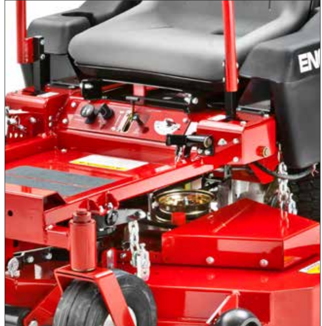
FUZION | Front Left View