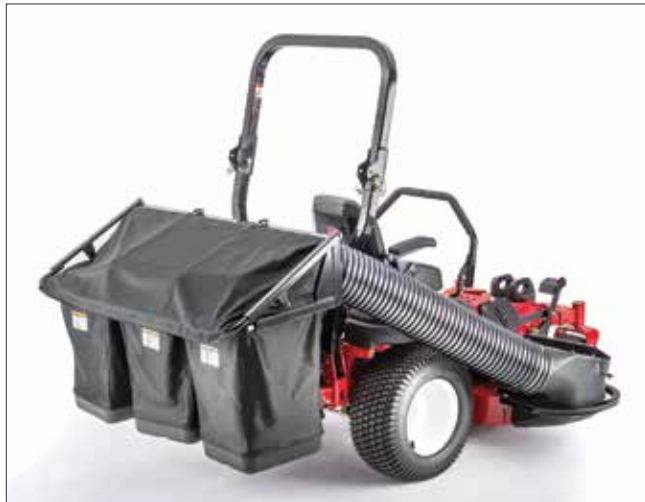
EDGE | Shown With Optional Bagger