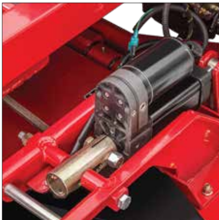
Prowler | Electric Deck Lift

Get power and versatility with the true, floating deck on a mid-mount rider. The Prowler's articulating, floating deck was developed to "keep the cut" on uneven ground—minimizing scalping and maximizing stability and comfort.