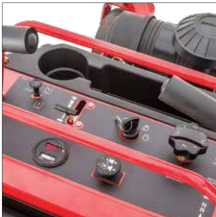
RAGE | Easy Access Height Adjustment Knob

The RAGE stand-on machine combines the flexibility and safety of a walk-behind mower with the speed and precision of a sit-down rider. The ergonomically designed, contoured operator pad and easy flip-up, shock absorbing platform are examples of the focus given to operator comfort. The RAGE will give you a professional cut without having to pay the professional price.