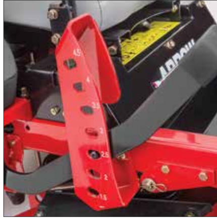
ARROW | Deck Lift