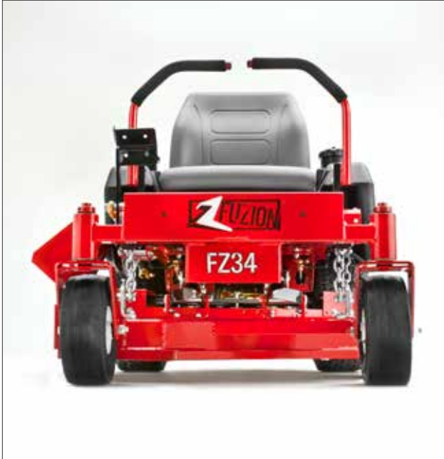
FUZION | Front View