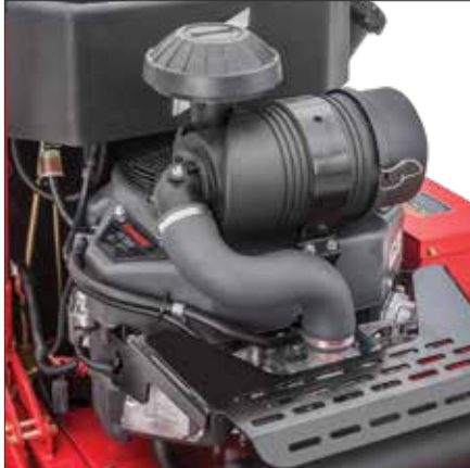
RAGE | Kawasaki Engine