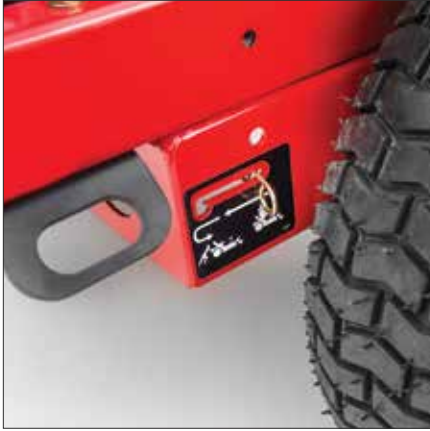
ARROW | Hydraulic Release