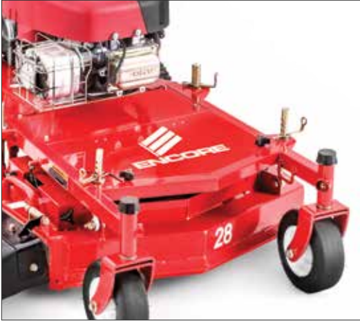
WALK BEHIND | Front View