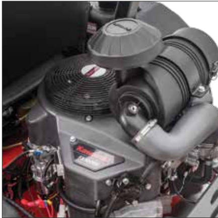
Prowler | Engine View