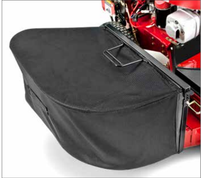
WALK BEHIND | Grass Catcher