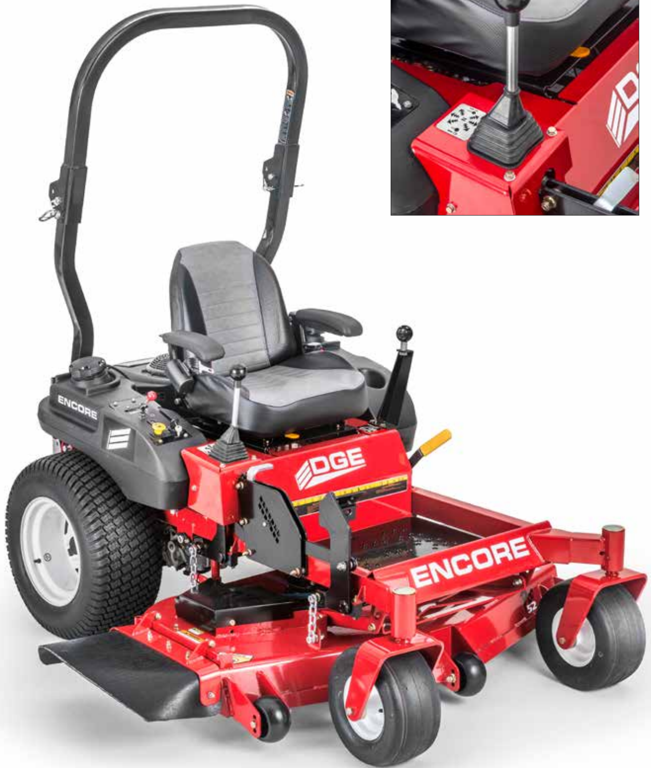
EDGE | Single Stick Steering