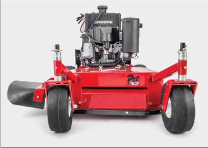
BELT SERIES | Front View