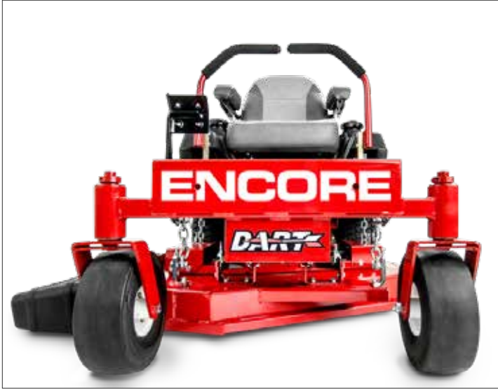
DART | Front View